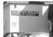
R.H. Murray Public School