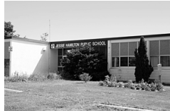
Jessie Hamilton Public School