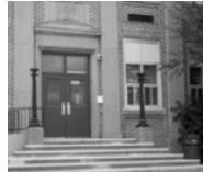
Copper Cliff Public School