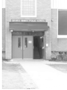
George Vanier Public School