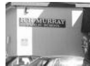
R.H. Murray Public School