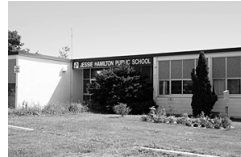
Jessie Hamilton Public School