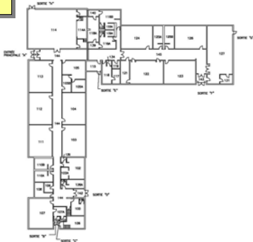
St. Thomas School